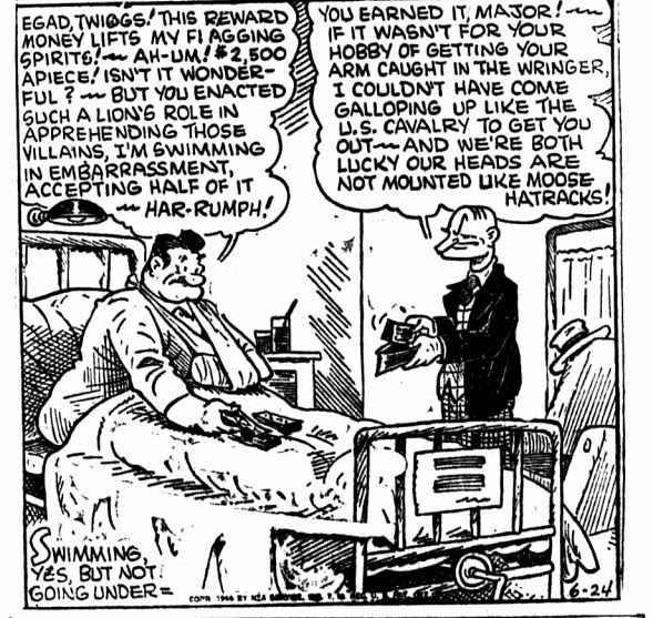
By HAM FISHER