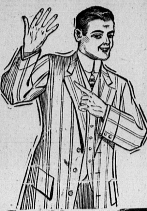
"The Home of Good Hats"