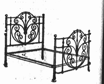
Strong Single Iron Bed.

Office roll top desk, well made of solid oak, polished, with solid oak writing bed, automatic drawer locks, slides on each side, 48 inches wide, 30 inches deep, 50 inches high.