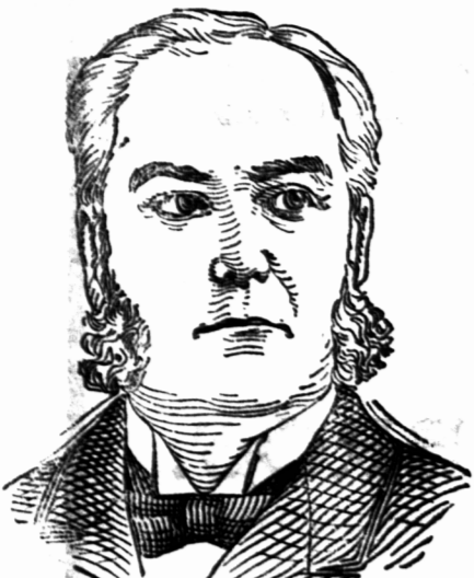
HON. H. H. POWERS.

Congressman H. Henry Powers, of Vermont, writes from Morrisville, Vt.: