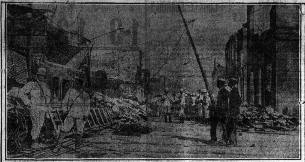
American Marines clearing streets and recovering bodies of dead.