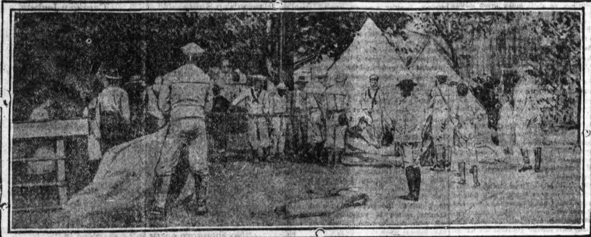
Marines from the Indiana and Missouri pick up dead men for wounded.