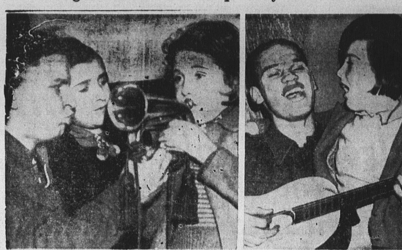
This little English girl, with characteristic modesty, does not blow her own horn, but takes a lesson in blowing the bugle from one of the Canadian troops. She's one of 300 refugee children from London's east end, adopted by Canadian soldiers quartered in the south of England, and this is their Christmas party. The other little girl, at the same party, sings while one of the Canadians strums a guitar.