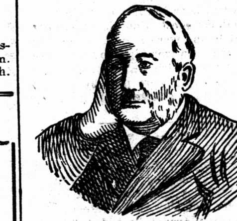
LORD ALVERSTONE. placed on the treaty of 1825 between Great Britain and Russia, which defined the boundaries between British America and Alaska.