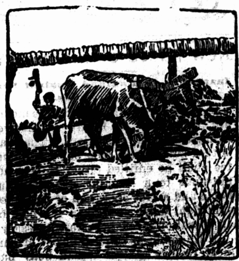
IRRIGATION PUMPING WORKS.

Bruce Stewart & Co., Founders, Engineers, Machinists and Boiler-makers, Steam Navigation Co's Wharf, Charlottetown, P. E. Island, P. E. 115.