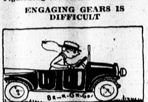
ENGAGING GEARS IS DIFFICULT