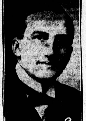
Lord Eustace Percy, minister of education in the Baldwin cabinet, who is on a short visit to the Dominion.