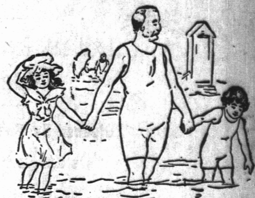
The Tall-Stout Man.

—Measures larger than normal on all lines below chest, smaller across back.