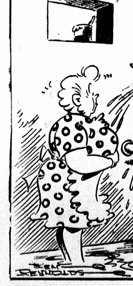
"Well, if I remember correctly that Guardian Want Ad said the house had 'running water!'"