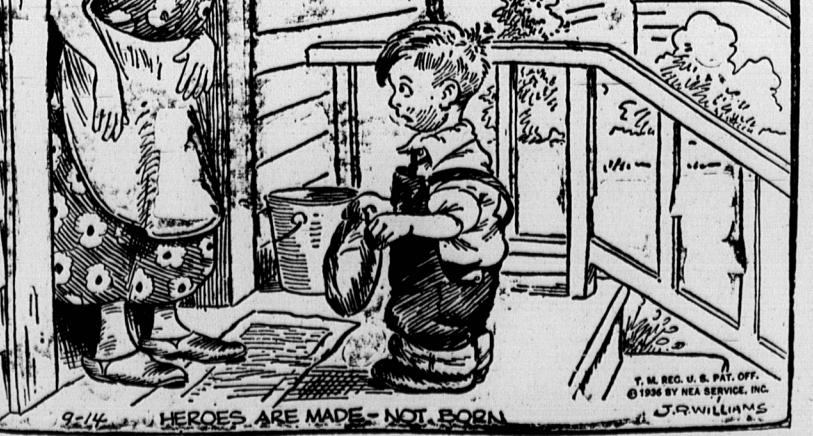
HEROES ARE MADE - NOT BORN