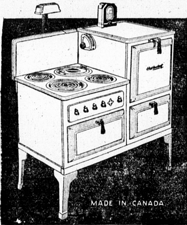
Canadian General Electric Hotpoint Range.

I used to worry about burning things. Now I fill my oven with cookies and they bake without watching—crisp, tender, just the right golden brown. My pie crusts, too, are much improved—so nice and brown every time.