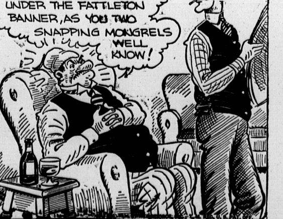
HE'S BUSY TWIDDLING HIS THUMBS.