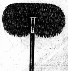
No. 1. REVERSIBLE MOP, chemically treated, a real labor saver for the busy housewife.

For prompt payments of instalments as they come due, Holman's will give ABSOLUTELY FREE WITH YOUR LAST PAYMENT on any of the above sets of dishes your choice of any one of the following:—