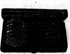
No. 3. TEASPOON SET comprising six silver plated teaspoons in nicely lined leather covered case.