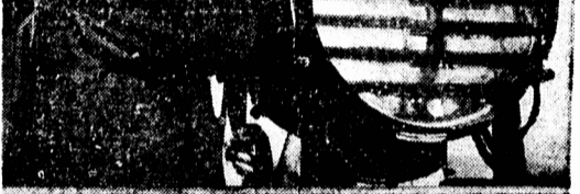
H.M.C.S. "SIOUX" and "ALONGQUIN" two of the most powerful destroyers in the world and recent acquisitions to the Royal Canadian Navy, played important roles in the Allies' great fleet which smashed at the French coast on the long awaited "D" Day.