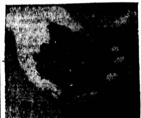
When soil crumbles like this, it is just right to spade.

To determine this point requires neither practice nor experience. Just pick up a handful of the soil and pat it between the hands. If it makes a mud-pie, the soil is too