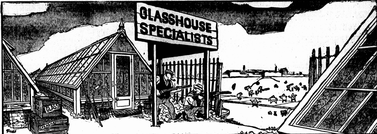
"You take the bowlers and I'll look after the batting."