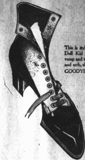
This is style 277 for Women Dull Kid blucher top, patent vamp and toe. New high heel and arch, slender smart shape. GOODYEAR PROCESS.