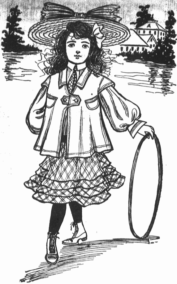
Shown here is a pretty mode for early fall jacket for a little girl. It is made from the grey broadcloth and is unlined. The trimming consists of stitching.