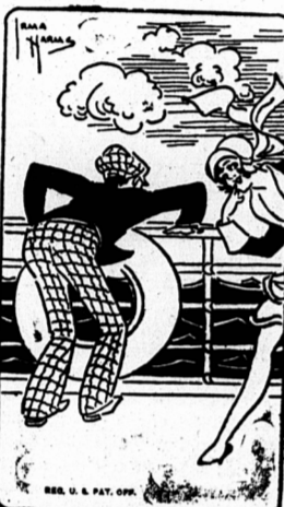
"Nobody expects to find anything good in a man at sea."