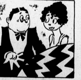
Modern Young Man: We are really nothing but trained animals. She: Who neglected your training?

WELCOME Oh, welcome back again the days— The glorious days of fall— When Frost rides through the autumn haze To hold the land in thrall! The morning chill, with snow entrain, The ice upon the lake. Oh, welcome to our board again, Ye olde tyme bucke wheate cayke!