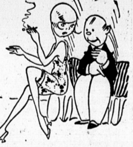
She: Does your brother keep a diary? He: He kept 15 of them last year. She: Must have kept him busy. He: Not necessarily. He's in the stationery business.