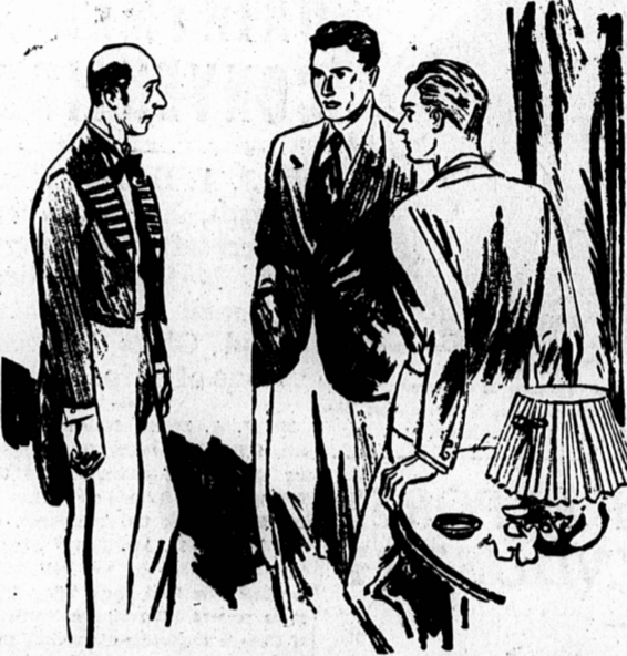
"I'm afraid sir, the poor gentleman must have died in his sleep"

"That was thoughtful of you, Pongo," said Ronny. "Now, tell me."