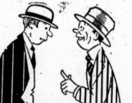
"Remember that it was a mere man, Columbus, who showed how to stand an egg on end."