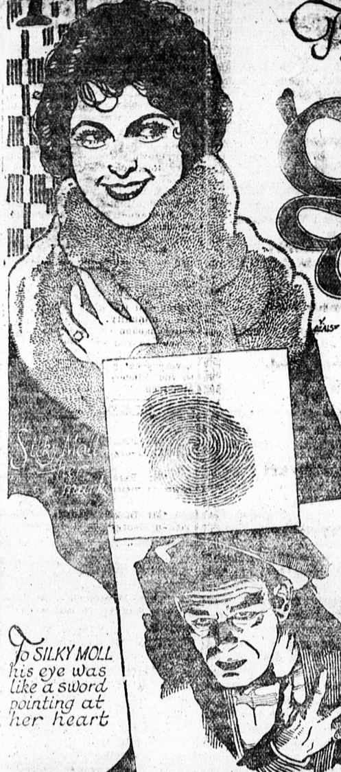
To SILKY MOLL his eye was like a sword pointing at her heart

UNIVERSAL JEWEL Production De-Luxe Presented by Carl Laemmle NOW PLAYING