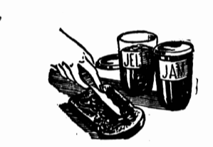
Jelly glasses per doz. 60c

SELECT THESE ITEMS IN OUR HARDWARE DEPARTMENT (LOWER FLOOR)