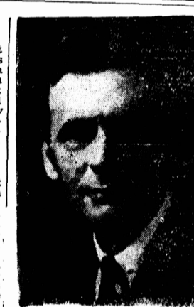
C. F. R. HOTELMAN HONORED