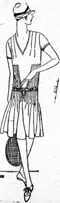
By Marie Belmont

THIS DASHING TENNIS FROCK IS OF BRIGHT YELLOW CREPE DE CHINE