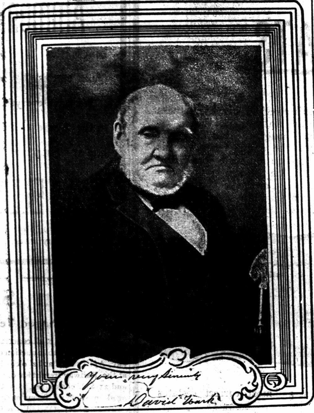
HON. DAVID WARK, CANADA'S "GRAND OLD MAN."

Canada's Grand Old Man Entering His Hundredth Year, But Soon to Leave Fredericton to Take Up Duties in the Senate at Ottawa.