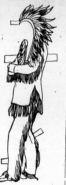
IN THE WOODS

This is the second day's chapter of the Indian legend, "Ugly Boy," children who save the paper dolls all this week will have the whole set of dolls to act out this story with.