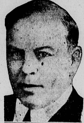
RT. HON. W. L. MACKENZIE KING

who includes Charlottetown and Summerside in his campaign today.