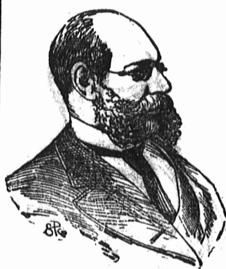
SIR RICHARD CARTWRIGHT.