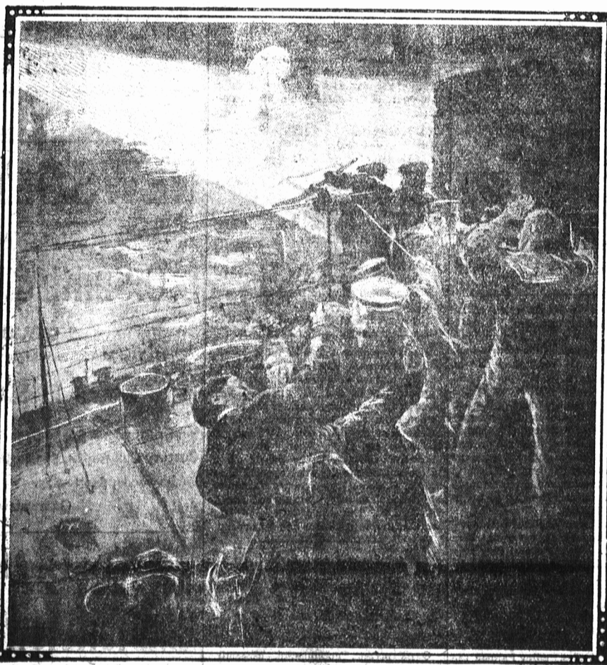
Cutting Out the Torpedo Boat Ryeshitelno.