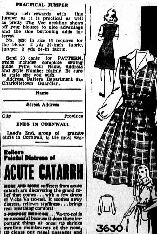
3630 SIZES 12-40