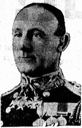
NEW ZEALAND'S VOICE