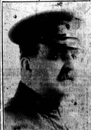
HEADS CHIEF CONSTABLES