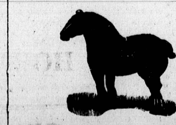
"Prince of the Crown"

Three choice pure bred Aberdeen Angus cows, two with young calves, also one pure bred Shorthorn cow and two young Shorthorn bulls, ten months and two years old. KENNETH B. RICHARDS, 6206-6-9Mmonthumon31, Bedford Farm 6206-6-9Mmonthumon31, Bldford Farm