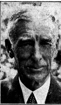
Veteran manager of the Philadelphia Americans who sees another world series in the offing, only to be out of the running. Philadelphia is well down on the league table this year, being next to the bottom.