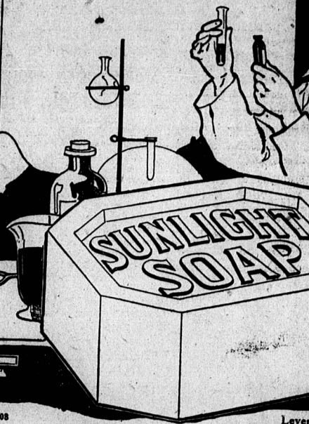
Lever Brothers Limited Toronto