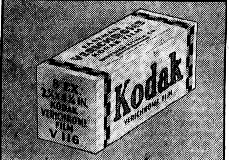
You can get the new 8-exposure roll in regular Kodak Film 116 and 120 as well as in the "fast-seeing" new Verichrome

2 extra exposures to the roll of Kodak Verichrome Film V116 and V120