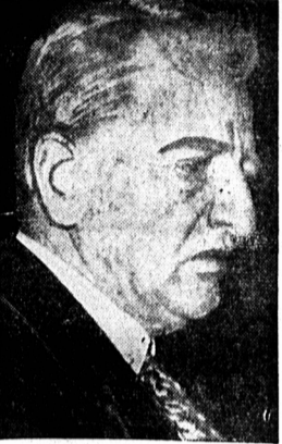
FRIEND OF BRITAIN Dean of United States senators, Senator Carter Glass, 82, declares "there is nothing we shouldn't give Britain. Her cause is our cause."