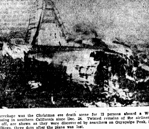
This wreckage was the Christmas eve death scene for 12 persons aboard a Western Airlines transport, missing in southern California since Dec. 24. Twisted remains of the airliner, its tail section broken off, are shown as they were discovered by searchers on Guyanape Peak, 50 miles southwest of San Diego, three days after the plane was lost.