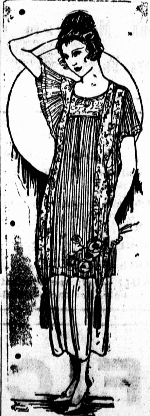
Breakfast Coat of Taffeta or Sheer Cotton.

Negligee garments for warm weather must be made on simple lines if they are to give really satisfactory service. Many trips to the cleaning establishment or the laundress are necessary for all types of summer apparel. That is one reason why simplicity is a safe guide. Then too, elaborate cloths always look warmer than simple things. That is also an excellent argument in favor of simplicity. One very practical type of negligee, popular ever since it was first introduced four or five seasons ago, is the breakfast coat. It is an all-year favorite and for summer is particularly attractive developed in voile or organdy or in dotted Swiss. Ruffles of self-fabric or lace edging is all the trimming required. The breakfast coat may be worn on the porch all the morning without the warmer feeling that she really is in negligee apparel. The sketch shows a breakfast coat which may be made of sheer cotton or of taffeta. The collar and lower part of the skirt may be embroidered in a block pattern, or the design may be worked out in pin tucking. If the coat is of taffeta little bands of hand embroidery done in a scroll design may give an additional trimming touch and if of cotton, lace or embroidery insertion may be used. A negligee of this type makes an excellent Pullman robe. The slip-over Pullman robe brought out a season or two ago, and highly commended by some who have tried it,