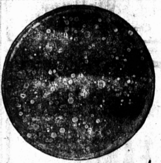
Colonies of Bacteria developed from germs, which settled on gelatine plates during one minute's exposure, after sweeping with common floor brush and saw dust.

Used in several buildings in Charlottetown and giving universal satisfaction. Call and see them at Cameron's