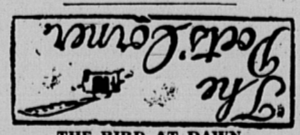
THE BIRD AT DAWN

Why wait until the symptoms overflow? See your family doctor before they get to that point.