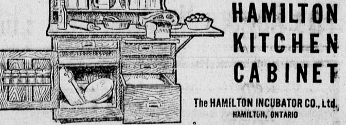
The HAMILTON INCUBATOR CO., Ltd., HAMILTON, ONTARIO

We will ship you a Hamilton Kitchen Cabinet subject to your approval. If you are not pleased with it, return it to us at our expense. Our booklet tells how you can pay for this wonderful device while it is paying for itself. Every housewife ought to have the Hamilton Kitchen Cabinet. It saves half your food. Write today, before you forget.