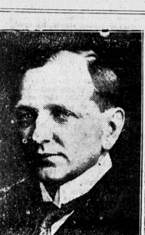
CUTS RATE OF INTEREST

Commencing Nov. 1, the Ontario Government has decided to reduce by 1 per cent, the rate of interest which is being paid upon deposits in the Provincial Savings Office, now amounting, according to Pro- vincial Treasurer Price's computa- tion, to $21,000,000. Instead of 4 per cent, interest, therefore, the Government will hereafter pay but 3 per cent, the same rate as the banks pay on savings.