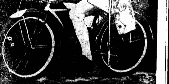
In 1746, Flora MacDonald, a Scottish noblewoman, rescued Prince Charles Stuart from pursuing British and that, boys and girls, is why this combination of ancient garb and modern transportation was seen in the streets of Red Springs, N. C., 200 years later. The young man is pedaling his way to Flora MacDonald College, to participate in a pageant celebrating the anniversary of Flora's romantic adventure with Bonnie Prince Charles.

A baby was born recently in a plane flying 16,000 feet above La Paz, Bolivia.