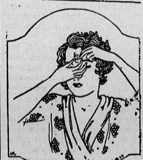
Hold the skin smoothly between the thumb and index finger

Uncorrected eye-strain not only brings premature eye wrinkles but may become a contributing cause of nervousness, underweight and various functional disorders. It is indeed a very short-sighted policy to put off seeing an eye specialist for fear that he may prescribe glasses.