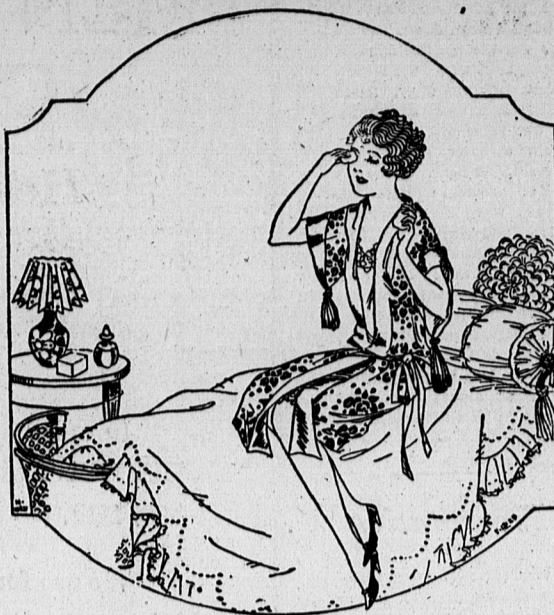
Apply the cotton compresses over closed eyelids