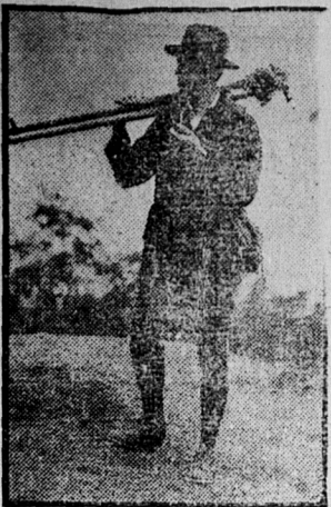
On big jobs a man must keep fit