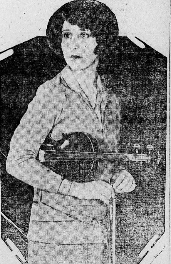
A girl stood staring at him, her violin cradled in her arm.

It was odd, Clay Curtis thought, as he walked briskly through the bitter cold of the early January night, that he should be thinking about dollars and cents instead of about his father, and his father's heartache and loneliness, and his own future. Twenty-one dollars and thirteen cents! Why, that wouldn't keep him a day at a hotel, the kind of hotel he'd been used to. Was that why his father had grinned when he looked at the money? Thought he'd be sneaking home again in twenty-four hours, broke and willing to be a good boy and mind his Dad. Funny how that cold-hearted little gold-digger's words kept coming back to him. And how he'd loved her! Her good and pink and white beauty! Her perfect body, displayed like a white statue to all who had five dollars and a half to pay for a ticket to the nudist revue in New York. She'd never been real, he knew now, until that last half hour, when she'd mocked him, laughed at him, and kicked him out for a bald-headed butter-and-egg man. Well, he couldn't walk the streets all night. He hardly