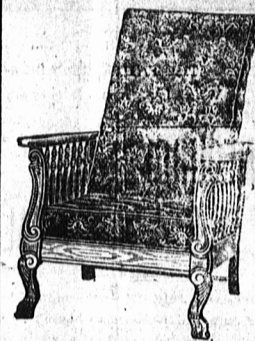
$6.50 to $20.00.