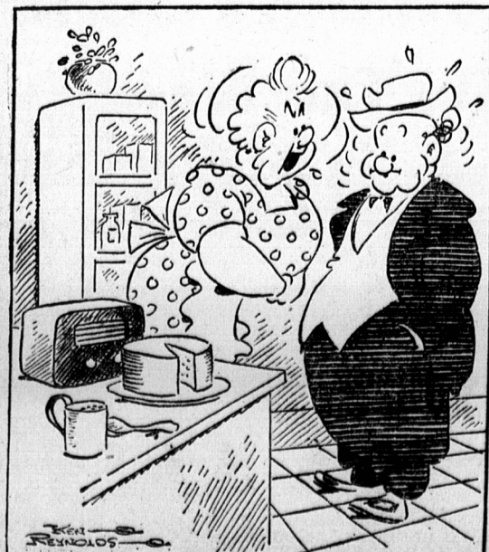
"You've got to get me a radio with a Guardian Want Ad—just taste the cake I made from the recipe of this cheap set!"