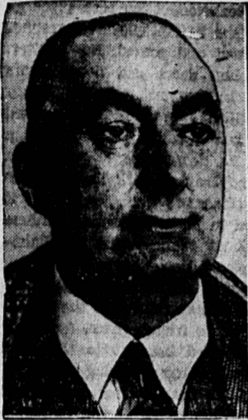
NOVELIST ARRIVES Edgar Wallace, British novelist, and playwright, as he arrived in New York recently on a visit to America.