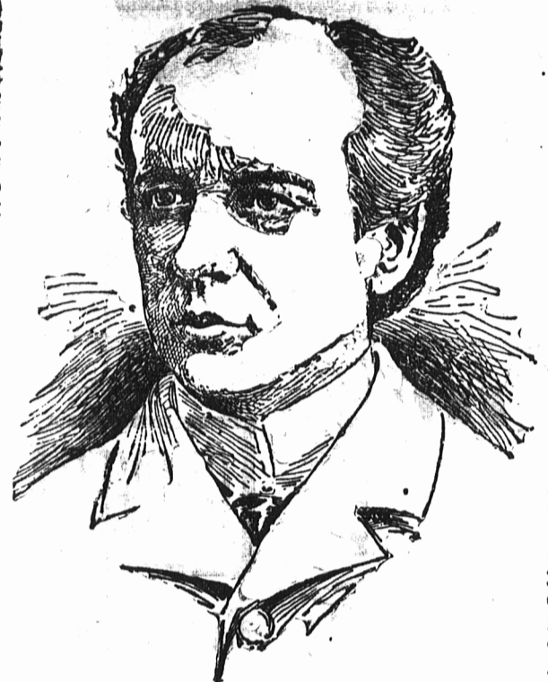
SIR WILFRID LAURIER, Premier of Canada.