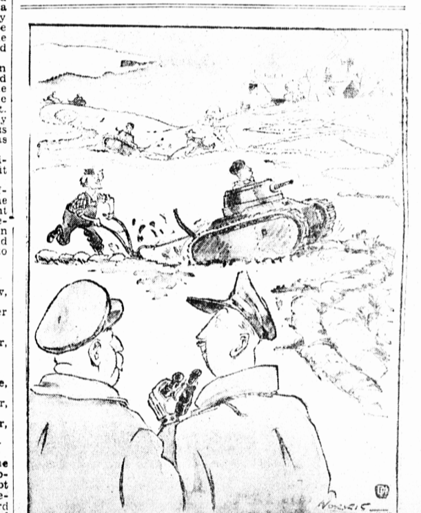
"Well—It's a sort of give and take arrangement, Colonel—our fall manoeuvres—his fall plowing!"