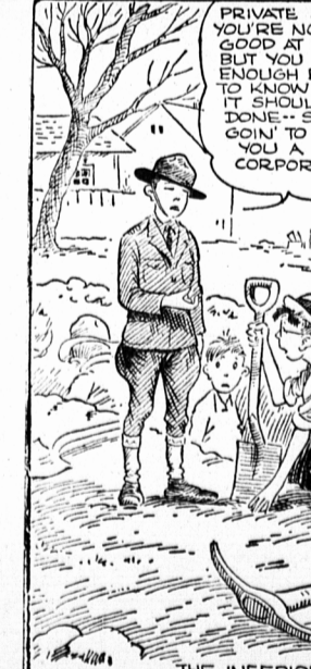
THE INFERIOR SUPERIOR