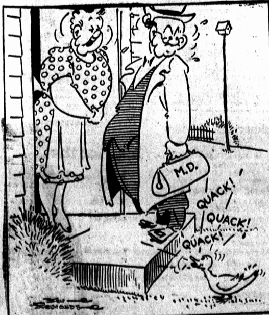
"Why, Doctor, our little pet duck we got with a Guardian Ad—seems to know you!"