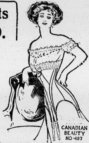
CANADIAN BEAUTY NO. 487