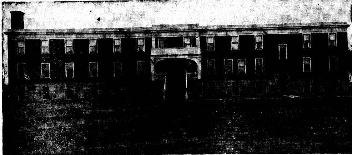
The Prince Edward Island Hospital School For Nurses,