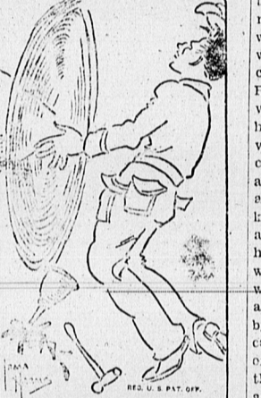
"A mechanic looking for broken poppers occasionally gets wind of one."