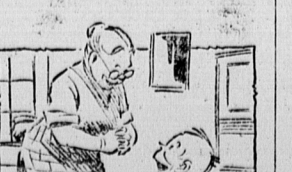
"Gee, he wouldn't be mistaken for anything bigger than a gnat!"