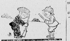
"Do Short says he doesn't go hunting because he might be mistaken for a deer."