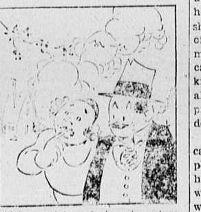
"It's great to get close to nature, isn't it?"